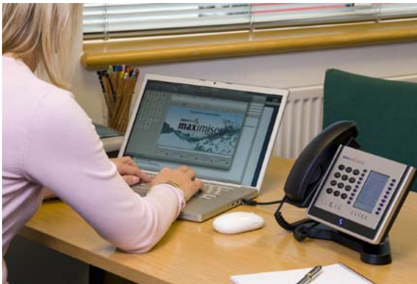
The stylish design of the PCS 560 & 570 looks good in any setting and from any angle